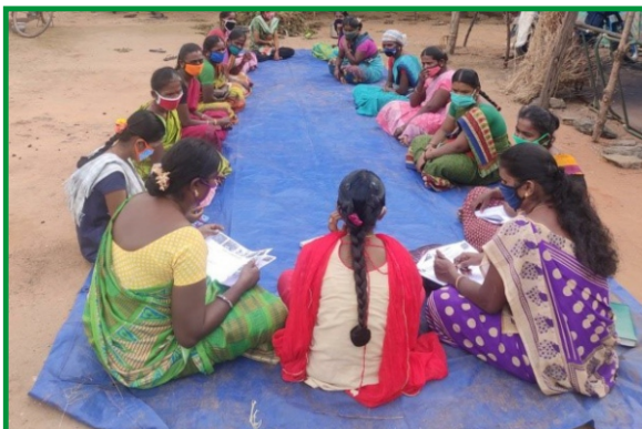
Barefoot Veterinarian training