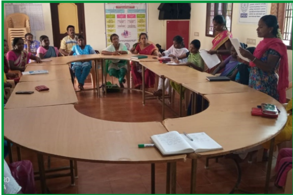
Facilitators Monthly Review Meeting