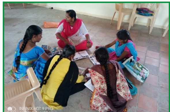
CMT Training to Volunteers