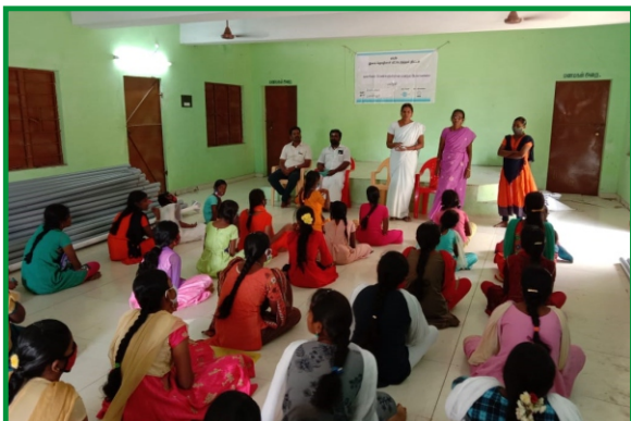
Mental Health Training to Adolescent girls