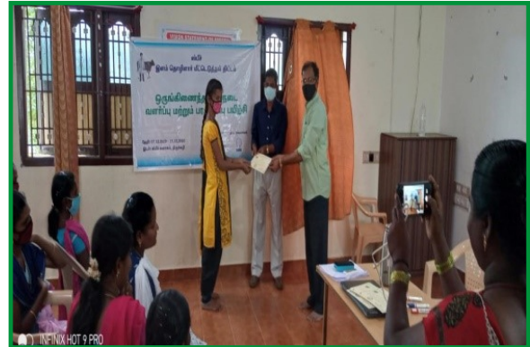
Barefoot veterinarian training to survivors