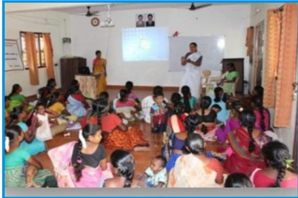
Medical Camp for Adolescent Girl Children