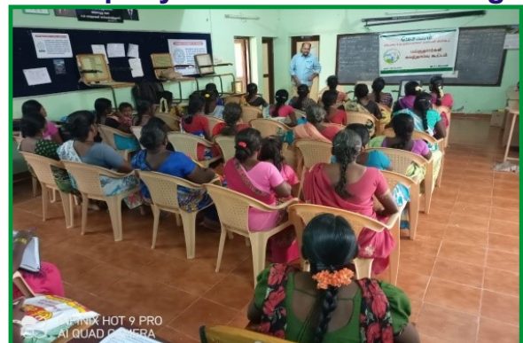
Meshavaram Agricultural Producer Company Shareholders Meeting