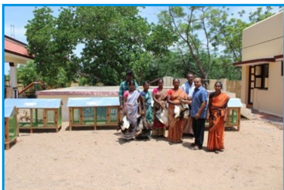
Country Chicken Support