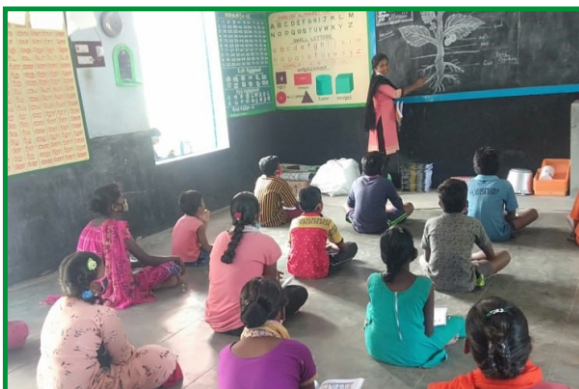
Community resource centre activities