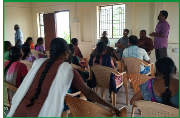
Higher Education Assistance College students